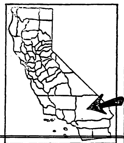
EXHIBIT "B" WP 3800