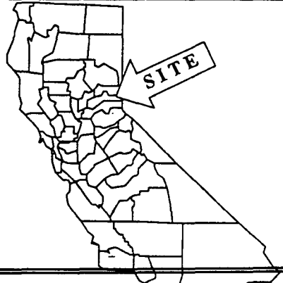
EXHIBIT "A" W 8670.64 APN 17 - 271 - 05 Donner Lake NEVADA COUNTY

This Exhibit is solely for purposes of generally defining the lease premises, and is not intended to be, nor shall it be construed as, a waiver or limitation of any State interest in the subject or any other property.