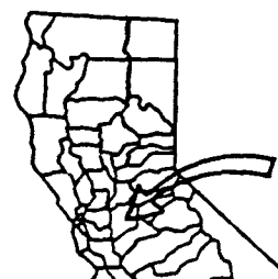
EXHIBIT "B" WP-6750