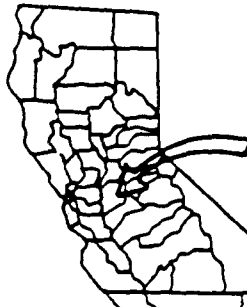
EXHIBIT "B" W 40651 PRC 7688