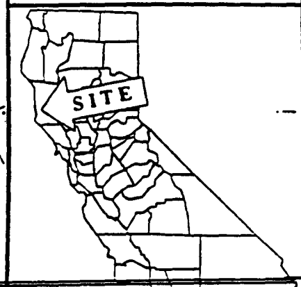
EXHIBIT "A" WP 3939 APN 123-170-23 Recreational Pier Permit Albion River MENDOCINO COUNTY

This Exhibit is solely for purposes of generally defining the lease premises, and is not intended to be, nor shall it be construed as, a waiver or limitation of any State interest in the subject or any other property.