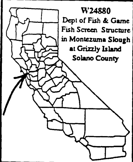
W24880 Dept of Fish & Game Fish Screen Structure in Montezuma Slough at Grizzly Island Solano County

This Exhibit is solely for purpose of generally defining the lease premise, and is not intended to be, nor shall it be construed as, a waiver or limitation of any State interest in the subject or any other property.