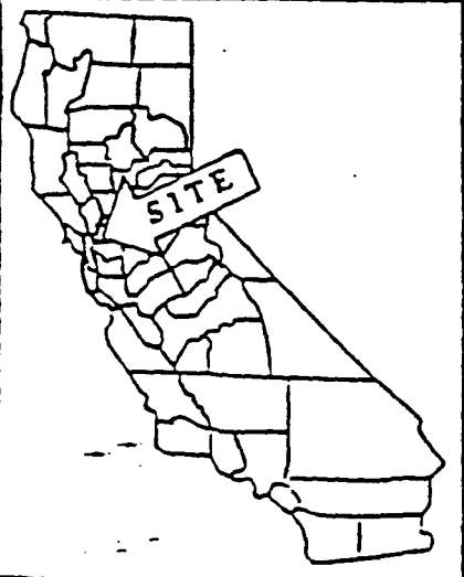
EXHIBIT "A" Land Description Exhibit W. O. 40699 Montezuma Slough SOLANO COUNTY

NOTE: THIS EXHIBIT IS NOT A SURVEY. NOR DOES ANY LINE APPEARING HEREON REPRESENT A BOUNDARY LINE