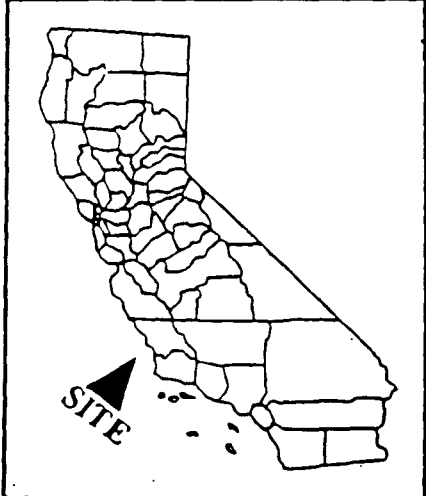
EXHIBIT "A" WP 5463 Application for Dredging Lease City of Morro Bay SAN LUIS OBISPO COUNTY Sheet 1 of 2 Sheets