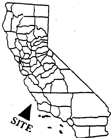
EXHIBIT "A" WP 5463 Application for Dredging Lease City of Morro Bay SAN LUIS OBISPO COUNTY Sheet 2 of 2 Sheets