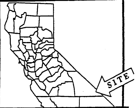
EXHIBIT "A" W 40660 & W 40661 S36, T25N, R5E, MDM & S16, T26N, R5E, MDM INYO COUNTY

This Exhibit is solely for purposes of generally defining the lease premises, and is not intended to be, nor shall it be construed as, a waiver or limitation of any State interest in the subject or any other property.