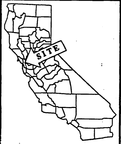
EXHIBIT "A" Land Description Exhibit WP5617 Point Richmond Ferry Point Pier CONTRA COSTA COUNTY