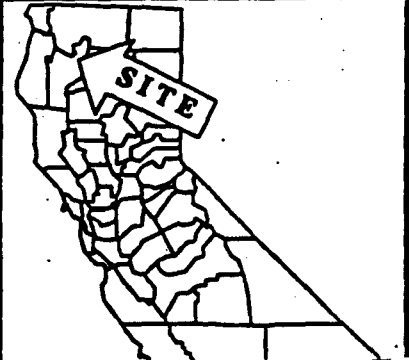
EXHIBIT "B" W25050 L. A. GRANGE PARCEL Vicinity Clair Engle Lake TRINITY COUNTY

This Exhibit is solely for purposes of generally defining the lease premises, and is not intended to be, nor shall it be construed as, a waiver or limitation of any State interest in the subject or any other property.