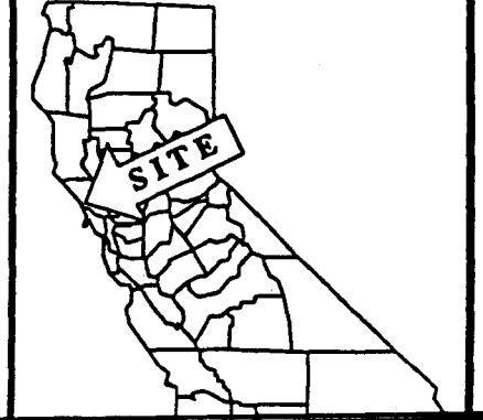
EXHIBIT "A" W 24978 Dredging Lease Application Sonoma County Regional Parks SONOMA COUNTY

This Exhibit is solely for purposes of generally defining the lease premises, and is not intended to be, nor shall it be construed as, a waiver or limitation of any State interest in the subject or any other property.