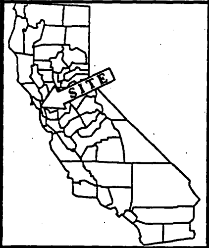
EXHIBIT "A" SITE MAP WP 7226 HAMILTON AIR FIELD CITY OF NOVATO MARIN COUNTY