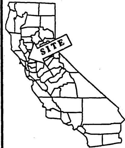
VICINITY MAP 1" = 1,000'

NOTE: THIS EXHIBIT IS NOT A SURVEY, NOR DOES ANY LINE APPEARING HEREON REPRESENT A BOUNDARY LINE.