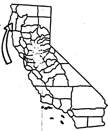
EXHIBIT "B" W 24801