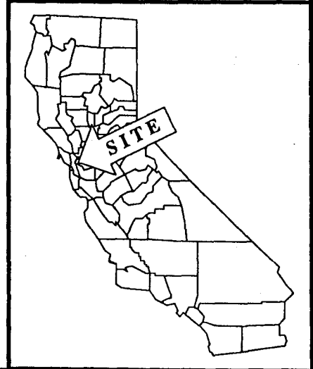
EXHIBIT "A" Application for Dredging Lease W 24908 Schnitzer Steel Products Co. OAKLAND ESTUARY ALAMEDA COUNTY

This Exhibit is solely for purposes of generally defining the lease premises, and is not intended to be, nor shall it be construed as, a waiver or limitation of any State interest in the subject or any other property.