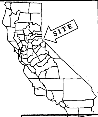
EXHIBIT "A" FOR PACIFIC BELL

EXHIBIT "A" W 24842 Submarine Cable Crossing Emerald Bay LAKE TAHOE EL DORADO COUNTY