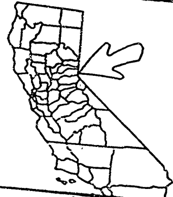
EXHIBIT "B" PRC 5449.1