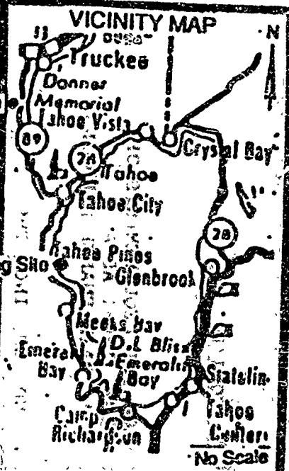
EXHIBIT "A" APPLICATION FOR MAINTENANCE DREDGING OBEXER AND SON INC. WP 5270 LAKE TAHOE PLACER COUNTY