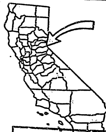
EXHIBIT "A" APPLICATION FOR MAINTENANCE DREDGING PERMIT FIREMAN'S FUND INSURANCE CO. WP 7368 LAKE TAHOE AT TAHOE MARINA RESORT. PLACER COUNTY