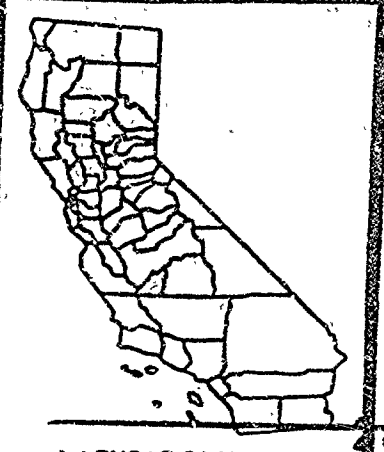
EXHIBIT "A" LAND DESCRIPTION Montezuma Slough Soiano County PRC 5893