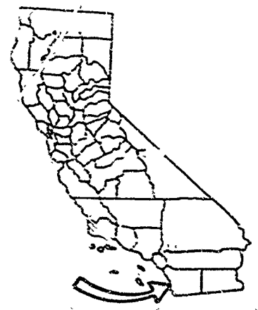
EXHIBIT "A" WP 5265