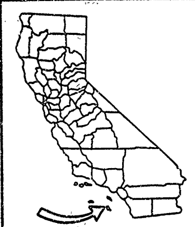
EXHIBIT "B" PRC 6412

Santa Barbara Island Santa Barbara County