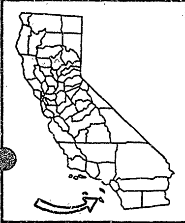
EXHIBIT "B" PRC 6411