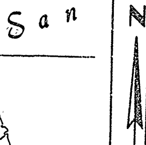
EXHIBIT "B" PRC 2651.1