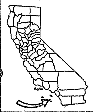
EXHIBIT "B" PRC 6441 PRC 6442

Santa Barbara Channel National Monument SANTA BARBARA COUNTY NATIONAL MONUMENT