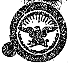
EXHIBIT "C" DEPARTMENT OF THE ARMY LOS ANGELES DISTRICT, CORPS OF ENGINEERS P.O. BOX 2711 LOS ANGELES, CALIFORNIA 90053-2721