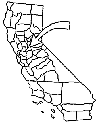
EXHIBIT "B" State Oil and Gas Lease PRC 7060 TXO PRODUCTION