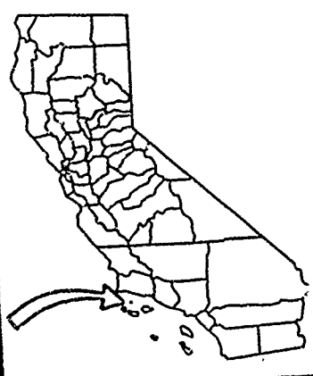
EXHIBIT "B" PRC 6911