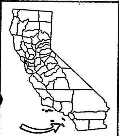
EXHIBIT "B" PRC 6457

Santa Barbara Island Channel Island Santa Barbara County National Monument