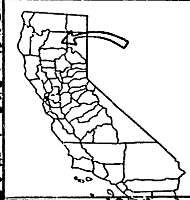
EXHIBIT "B" W 20188