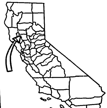
EXHIBIT "C" W 24192