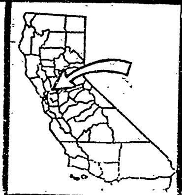
EXHIBIT "A" APPLICATION FOR DREDGING PERMIT SACRAMENTO-YOLO PORT DISTRICT W24049 SACRAMENTO RIVER DEEP WATER CHANNEL SOLANO-YOLO-SACRAMENTO & CONTRA COSTA COUNTIES