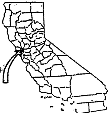
EXHIBIT "C" PRC 68 6