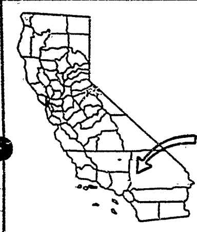
EXHIBIT "B" W 14032