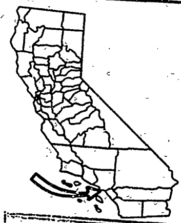
EXHIBIT "B" W: 23958