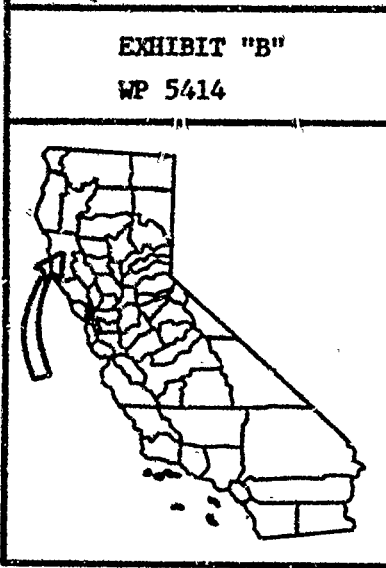
EXHIBIT "B" WP 5414