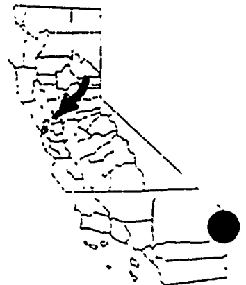
EXHIBIT "A" PRC 6723.1

Delta King Moccasin = 0.393 ac Dock Use = 0.512 ac