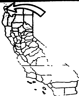
EXHIBIT "A" APPLICATION FOR DREDGING COUNTY OF DEL NORTE WP 5203 KLAMATH RIVER DEL NORTE COUNTY