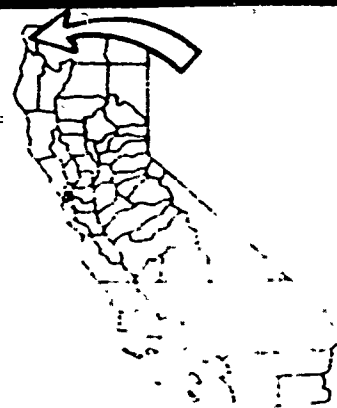
EXHIBIT "A" APPLICATION FOR DREDGING COUNTY OF DEL NORTE WP 5203 KLAMATH RIVER DEL NORTE COUNTY