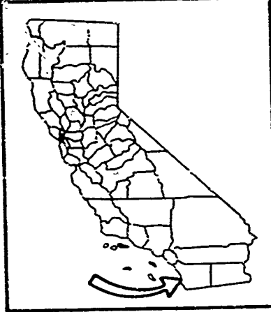
EXHIBIT "B" PRC 3136