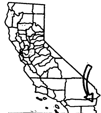
EXHIBIT "B" SA 5672