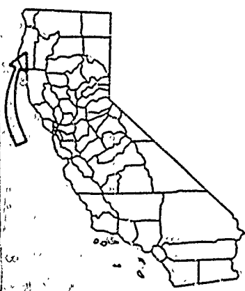
EXHIBIT "B" W 23696