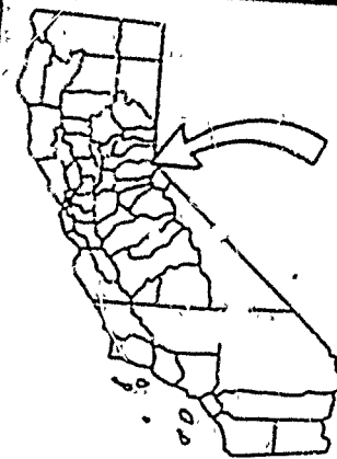
EXHIBIT "A" APPLICATION FOR DREDGING TAHOE KEYS MARINA (APPLICANT) WP 5305 SOUTH LAKE TAHOE EL DORADO COUNTY