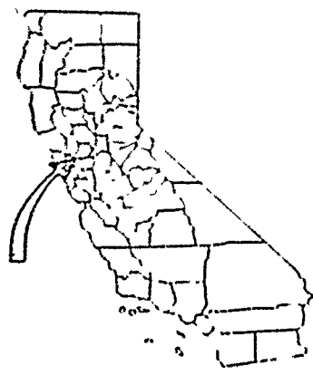
EXHIBIT "C" W 40451