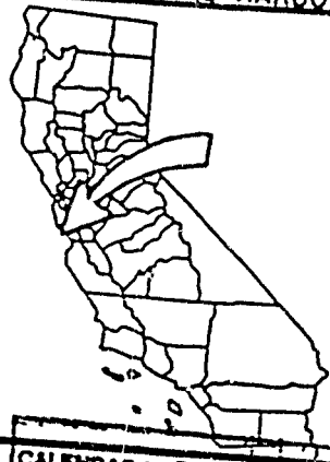
EXHIBIT "B" APPLICATION FOR DREDGING MOSS LANDING HARBOR DISTRICT (APPLICANT) WP 5116 MOSS LANDING HARBOR