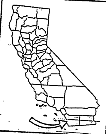
EXHIBIT "B" W 2400.153, W 2400.154 W 2400.155