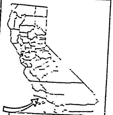
EXHIBIT "B" WP 550