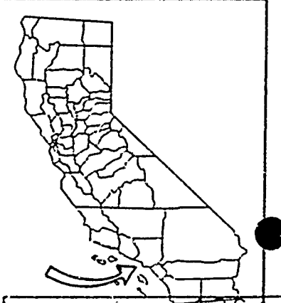
EXHIBIT "B" W 2400.156