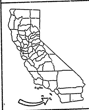
EXHIBIT "B" PRC 6438

Santa Barbara Island Channel Islands Santa Barbara County National Monument