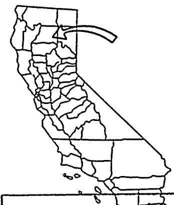
EXHIBIT "B" W 23652